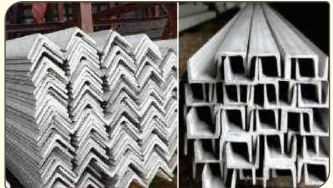
S. S. ANGLE & CHANNEL