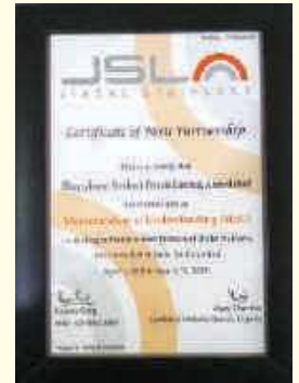
MoU - JSL