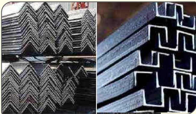
M. S. ANGLE & CHANNEL