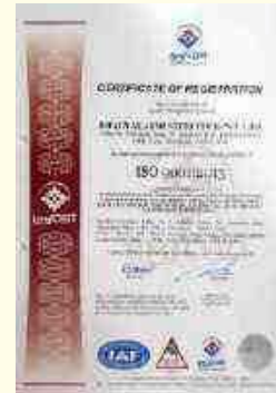
AN ISO 9001:2015