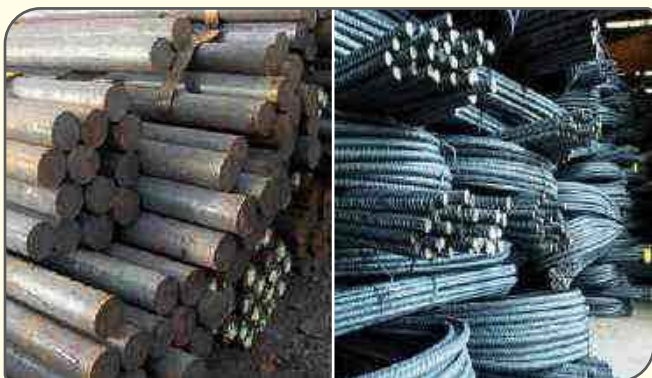
M.S. ROUND BAR | M.S. TMT BAR